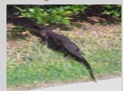
Kohr Family pet gator “Smiles”

CPNP/AC-PC, MPH Doctoral Student Division of Family and Community Health University of Pennsylvania School of Nursing